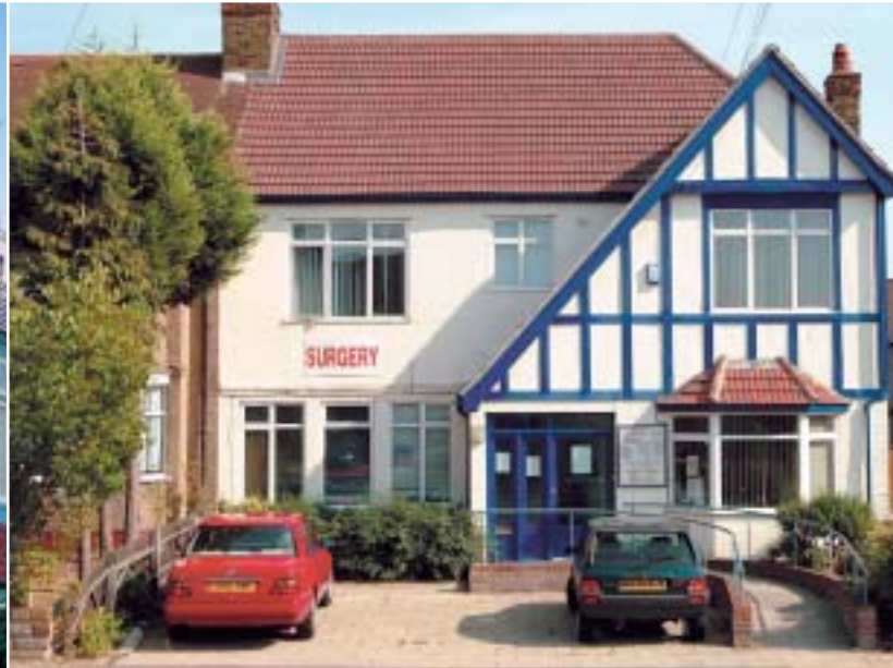
Autumn V2 on a Doctor's surgery in Ilford, Essex.